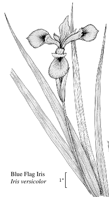
Blue Flag Iris Iris versicolor 1"

A useful guide to cultivating wildflowers.