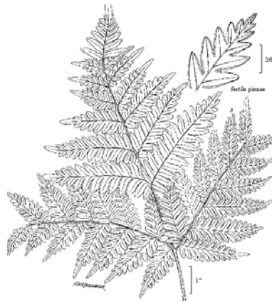
Royal Fern Osmunda regalis